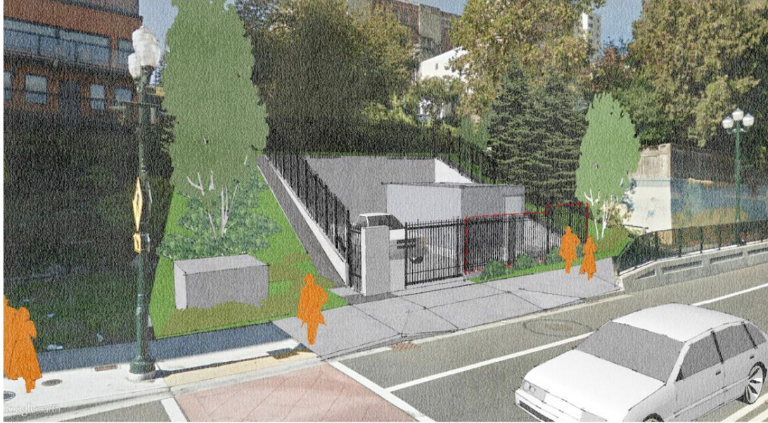
TPSS at Stadium Way and S 2 nd Street