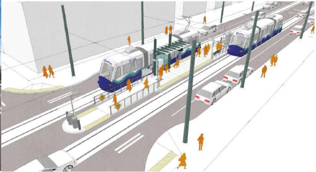
Aerial View, Typical Platform